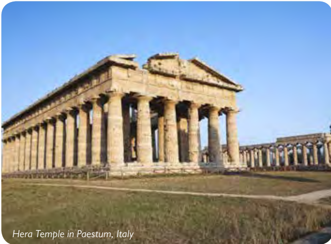
Hera Temple in Paestum, Italy

NB. Hotels of a similar standard may be substituted.