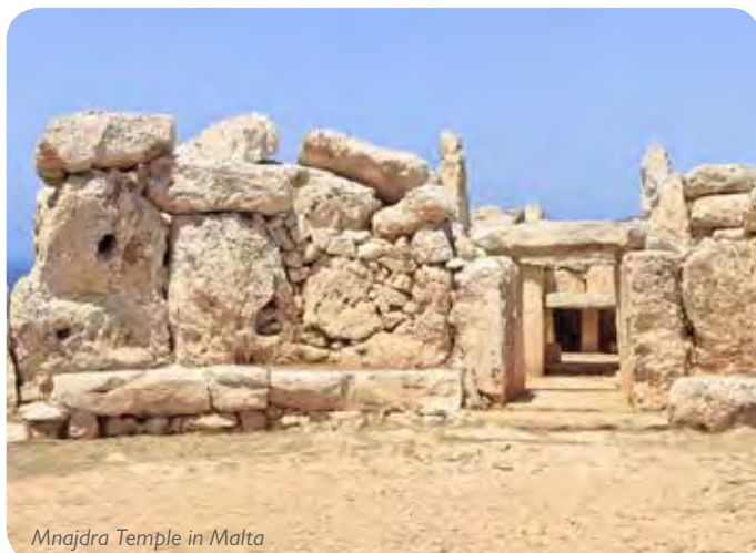
Mnajdra Temple in Malta

Optional cruise to the Blue Grotto and its neighbouring system of caverns mirroring the brilliant phosphorescent colours of the underwater flora (weather permitting).