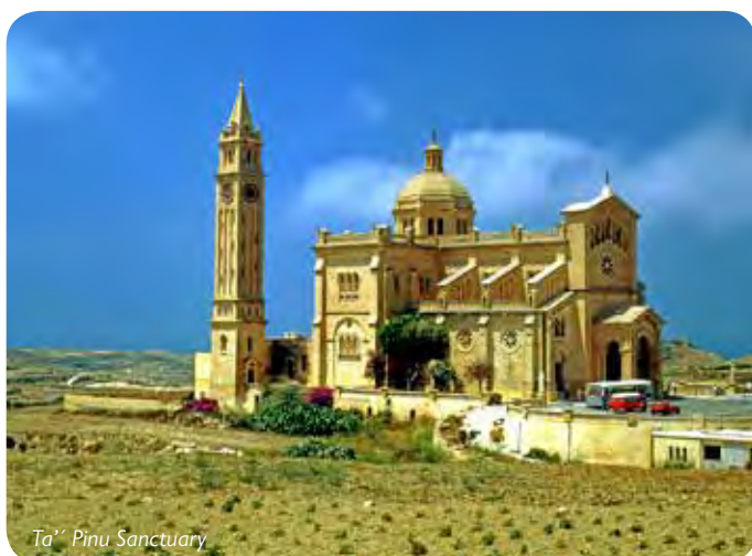
Ta' Pínu Sanctuary

You can find the full terms & conditions on the Renaissance Tours booking form. They can also be found at www.renaissancetours.com.au/booking-conditions/ or we would be happy to post you a copy on request.