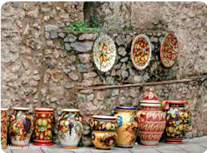
Vases in Ravello