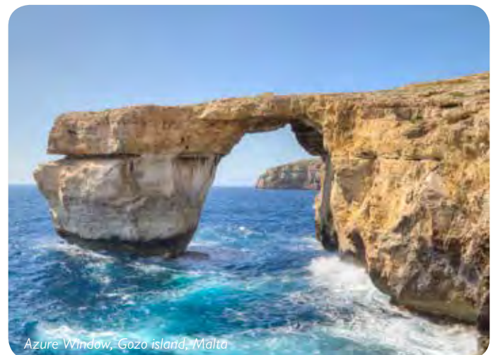
Azure Window, Gozo island, Malta