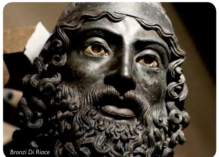
Bronzi Di Riace