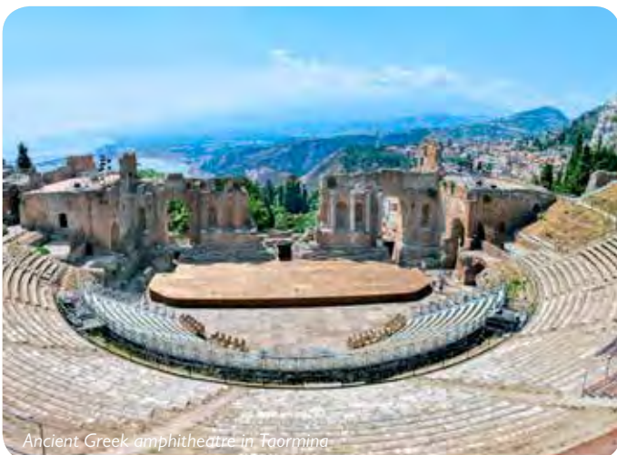
Ancient Greek amphitheatre in Taormina

After lunch at a local farmhouse, continue to nearby Piazza Armerina to visit the Villa Romana del Casale, a Roman villa built in the first quarter of the 4 th century and containing the world's richest, largest and most complex collection of Roman mosaics. B L